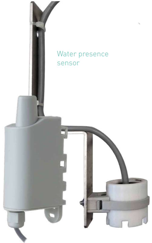
Water presence sensor